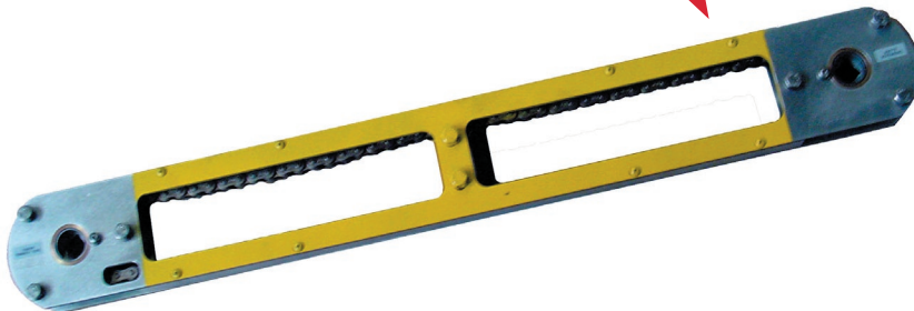
Figure 1.2 - Close-up of Chain Cartridge